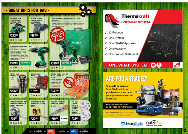
SmartTrade advert in an issue of the BuildLink catalogue.

Here are some examples of how businesses have used our logo in market.