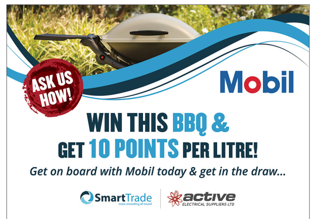
Active Electrical promotion signage.