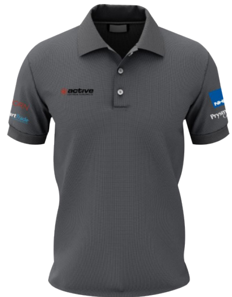
Active Electrical polos.